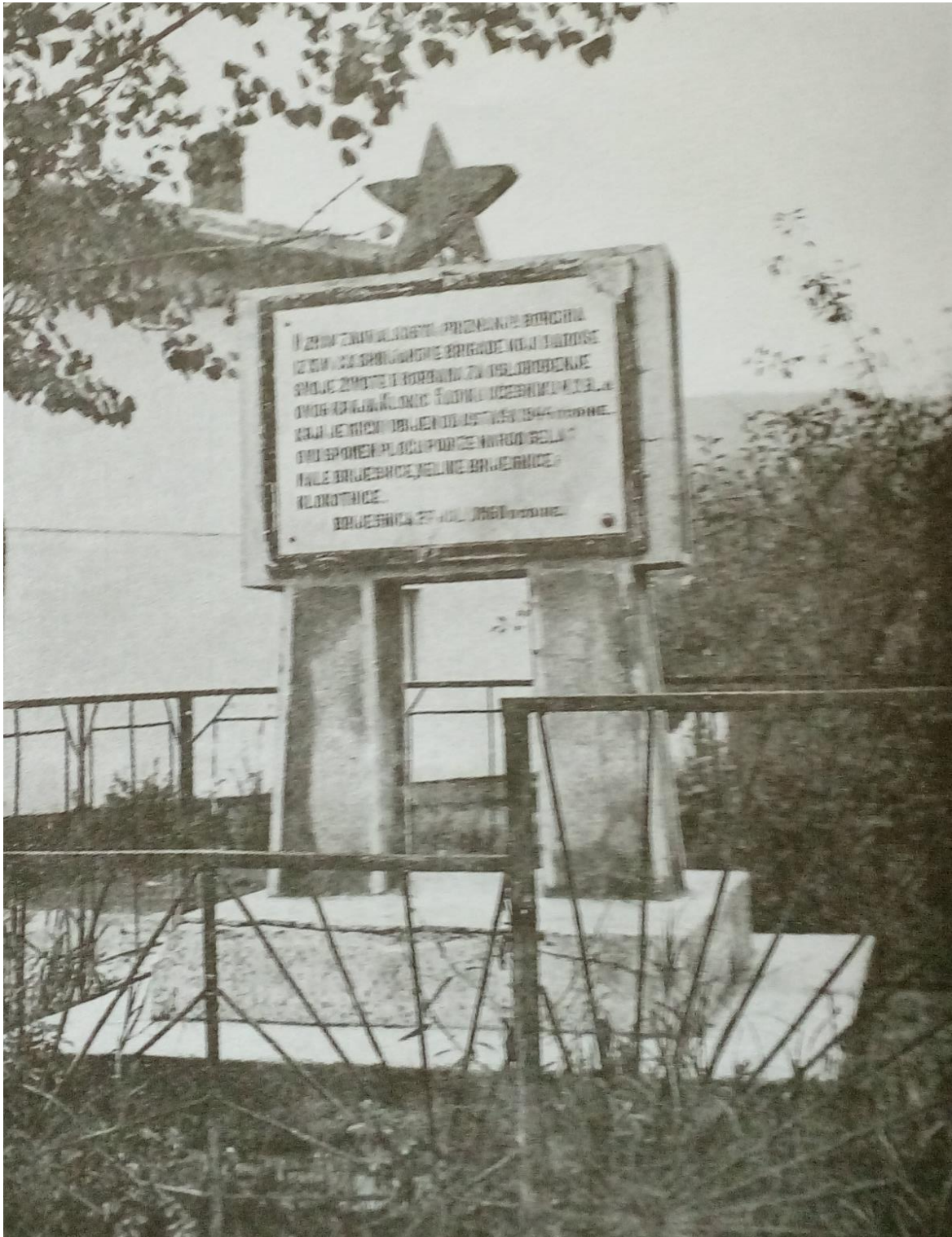
Figure 1a: Monument in Brijesnica Velika, 1980s