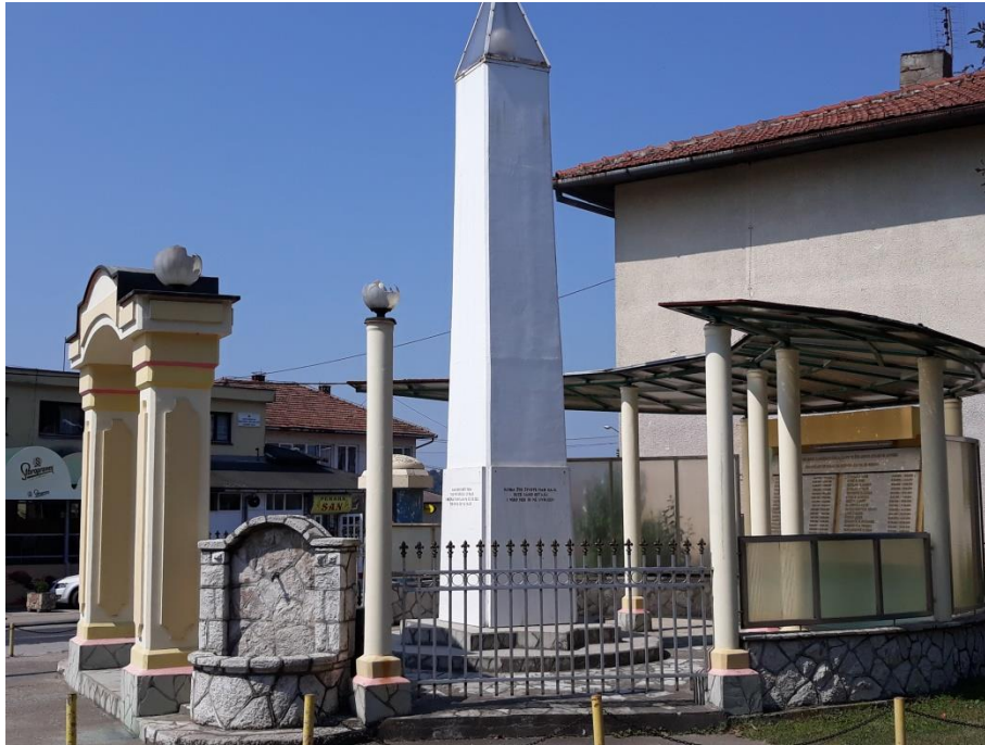
Figure 1b: Former location of Brijesnica Velika monument, 2018

This monument was located beside the main road in Brijesnica Velika, between Dobož and Gračanica. It was unveiled in 1960.