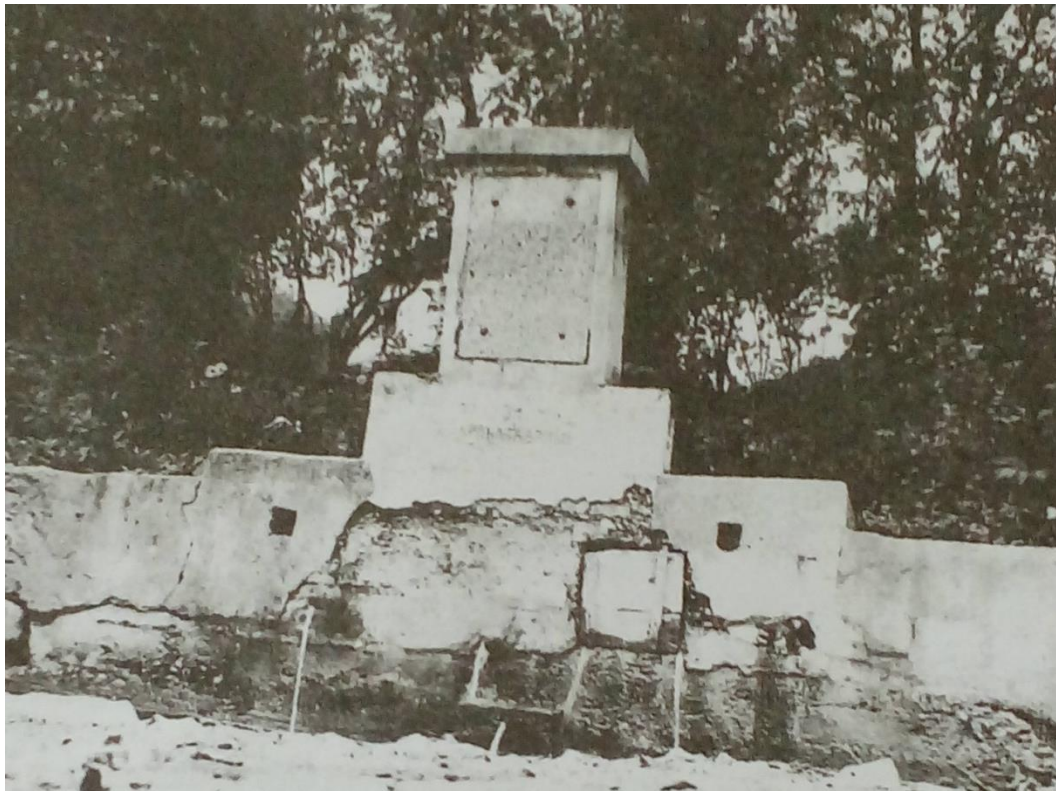
Figure 2a: Fountain in Gavrići, 1980s