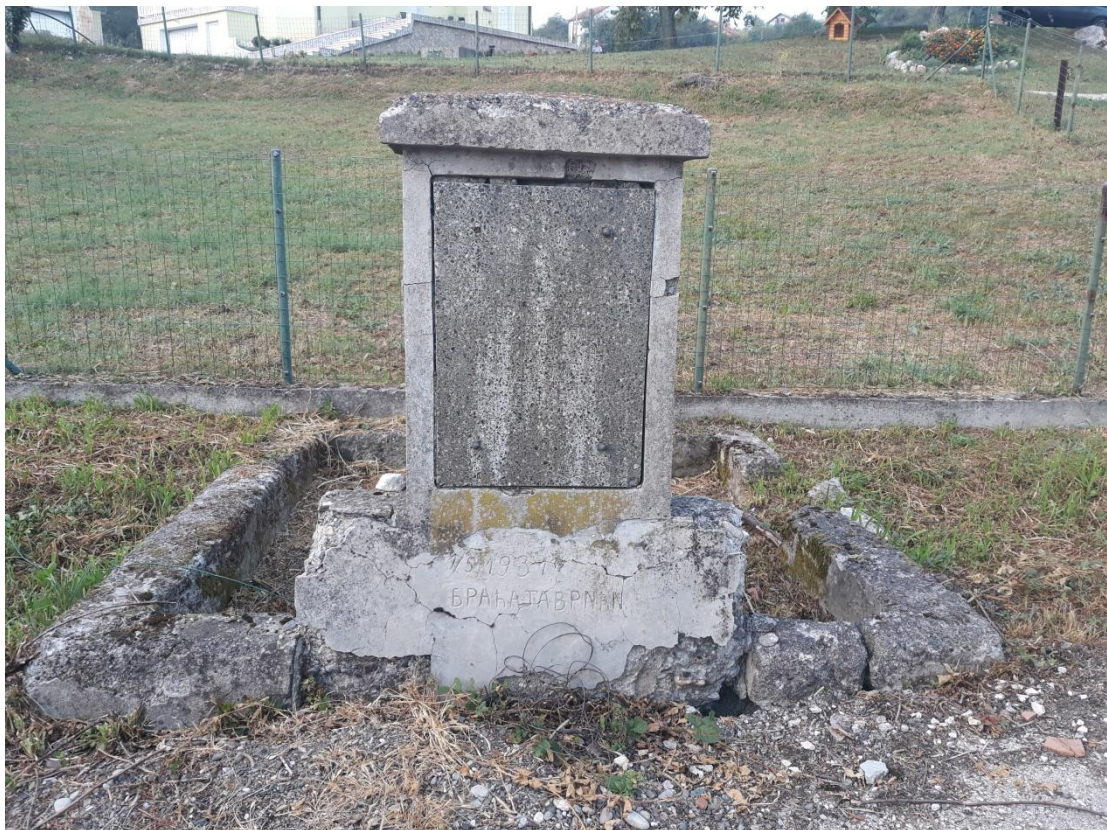
Figure 2b: Fountain in Gavrići, August 2018